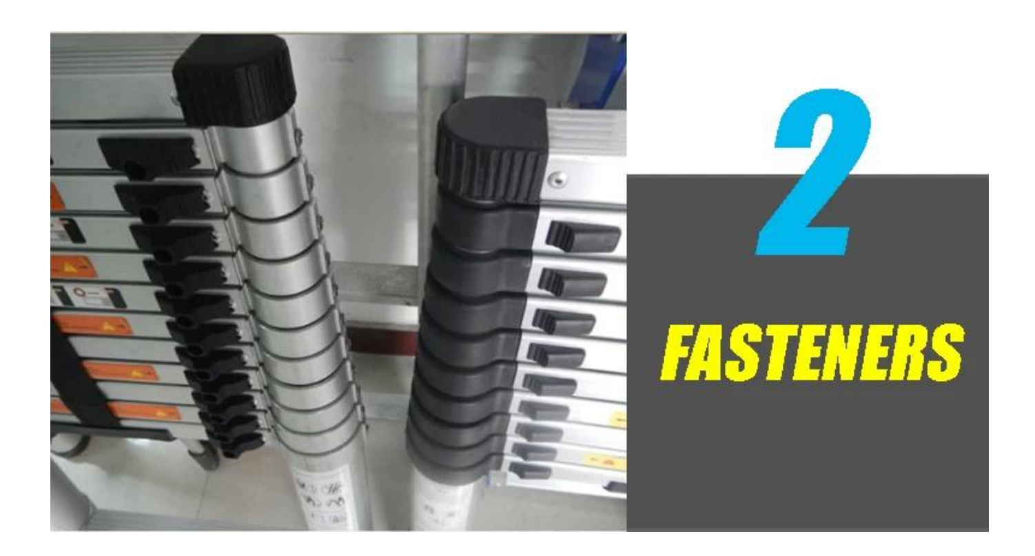
Extra thick aluminum construction