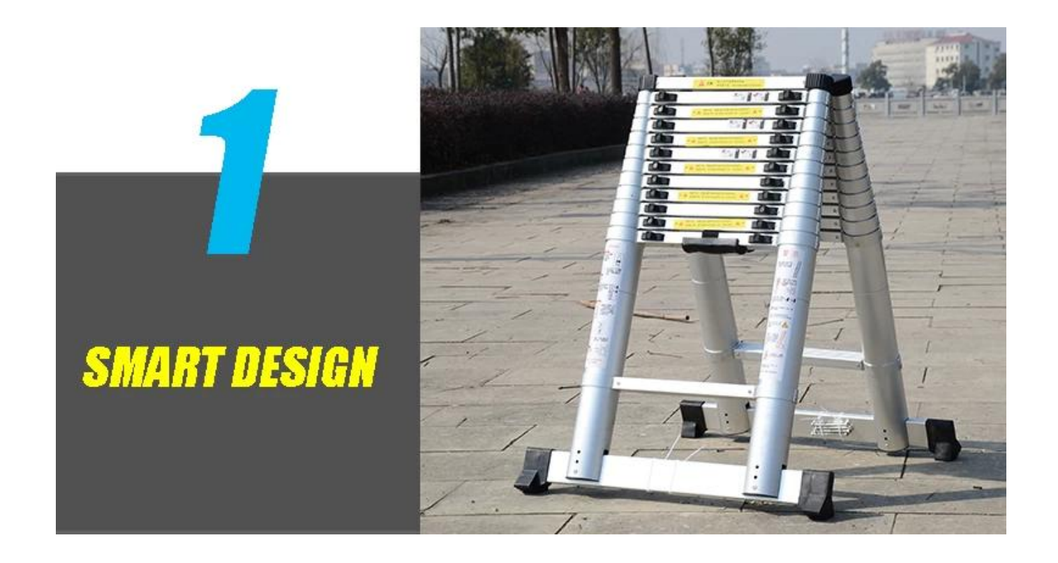
High strength aluminum fasteners